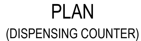
DETAIL AT A